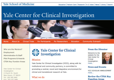
YCCI home page