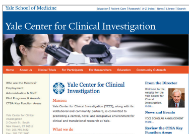
YCCI home page